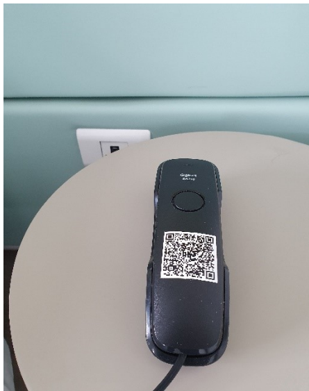
HOTEL WARRANTY BAJAMAR

We replace all the stationery in the room in a single document in digital format of immediate consultation through a QR code.