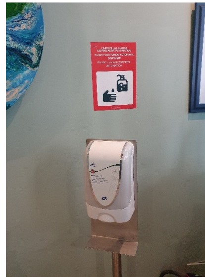
SECURITY PLAN FOR OUR CUSTOMERS - JUNE 2020